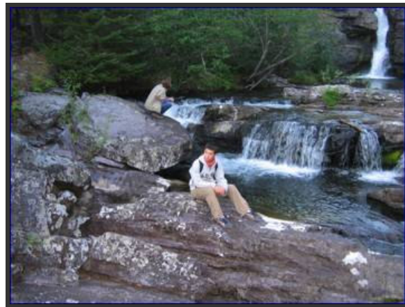
A weekend trip to the local waterfall. Learning Tibetan in Montana feels good!