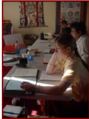
Summer Seminar Lev I