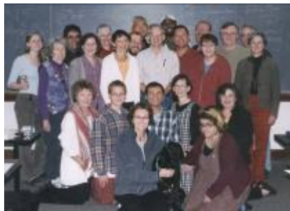
Rochester, NY Intensive