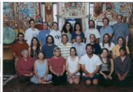
Rigzin Ling Seminars in California

So how does one go about learning some Tibetan?