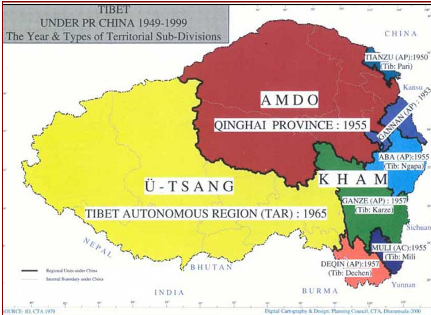
Map of Tibet under PR China, showing year and types of Territorial Sub-Divisions

Tibetan Language Institute P.O. Box 2037 Hamilton, MT 59840 USA Tel: 406/ 961-5131 Email: info@tibetanlanguage.org www.tibetanlanguage.org