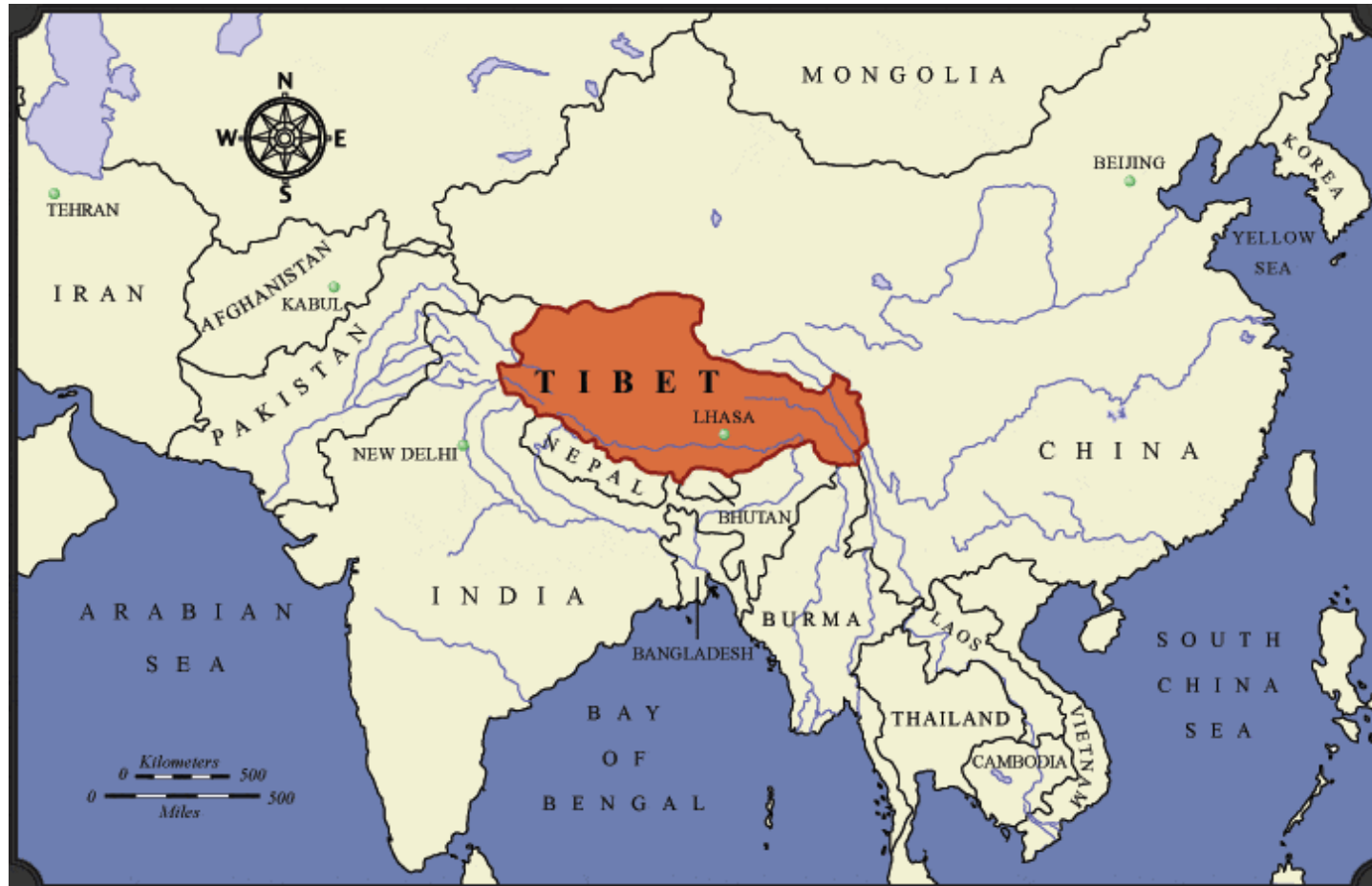
A map of Tibet within Asia